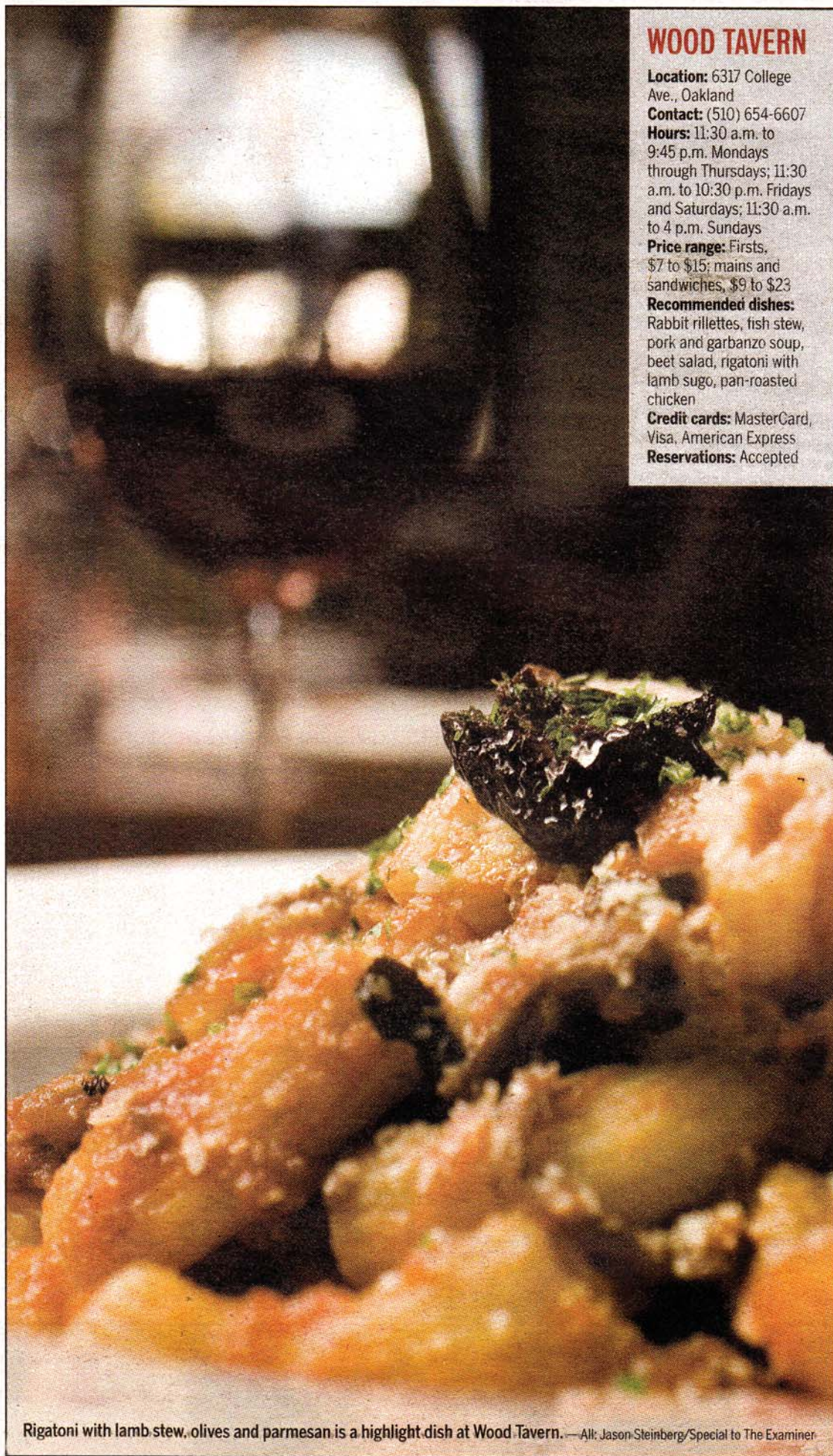
Rigatoni with lamb stew, olives and parmesan is a highlight dish at Wood Tavern.